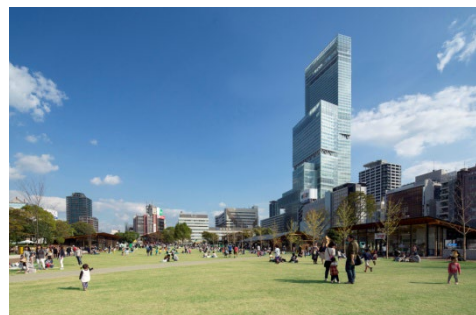
Abeno Harukas & Park, Osaka